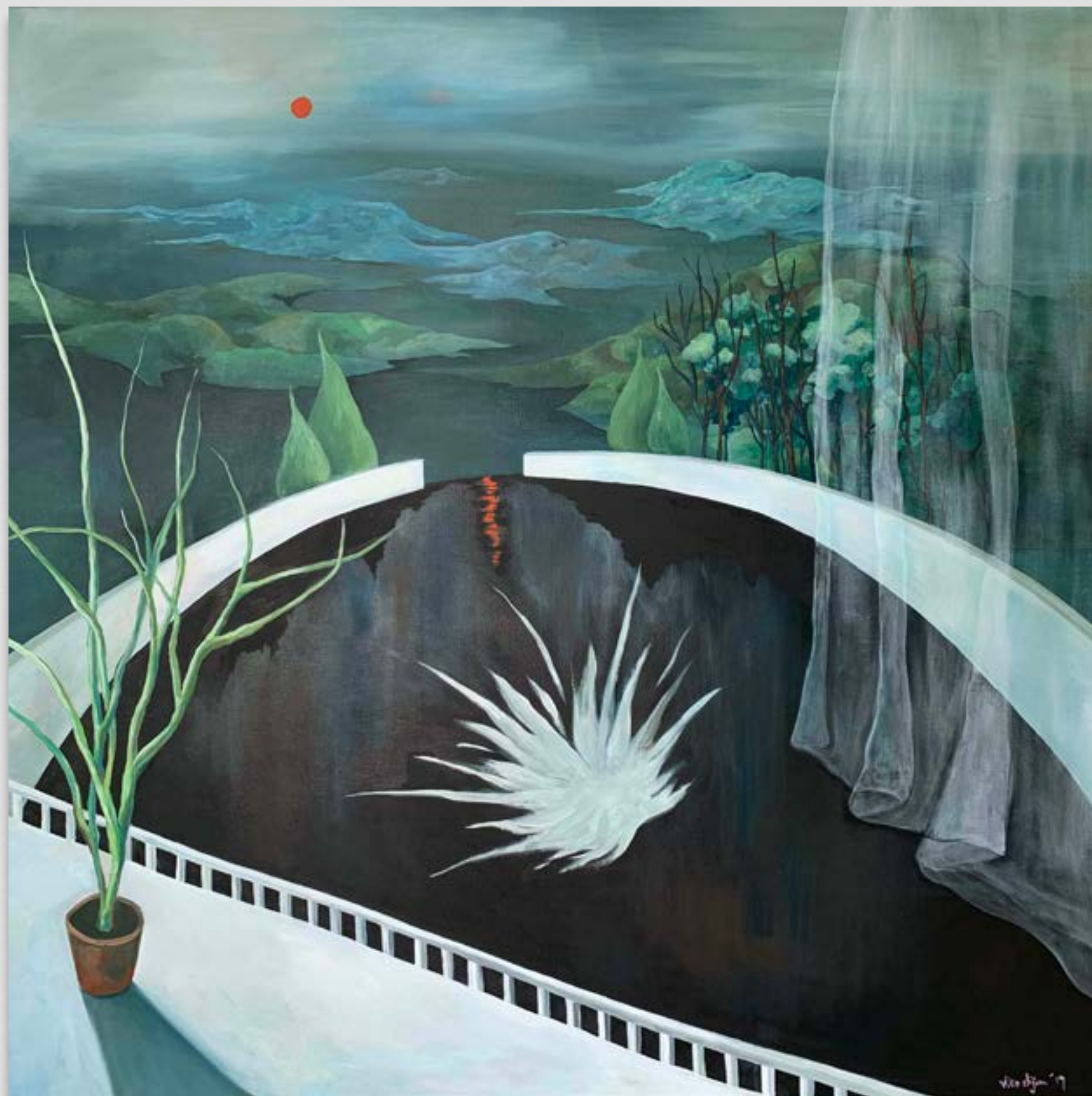
Viko Zhijune I Set A Quiet Fire For The Passerby When It Is Cold Out There 2019 130x130cm Oil on Canvas