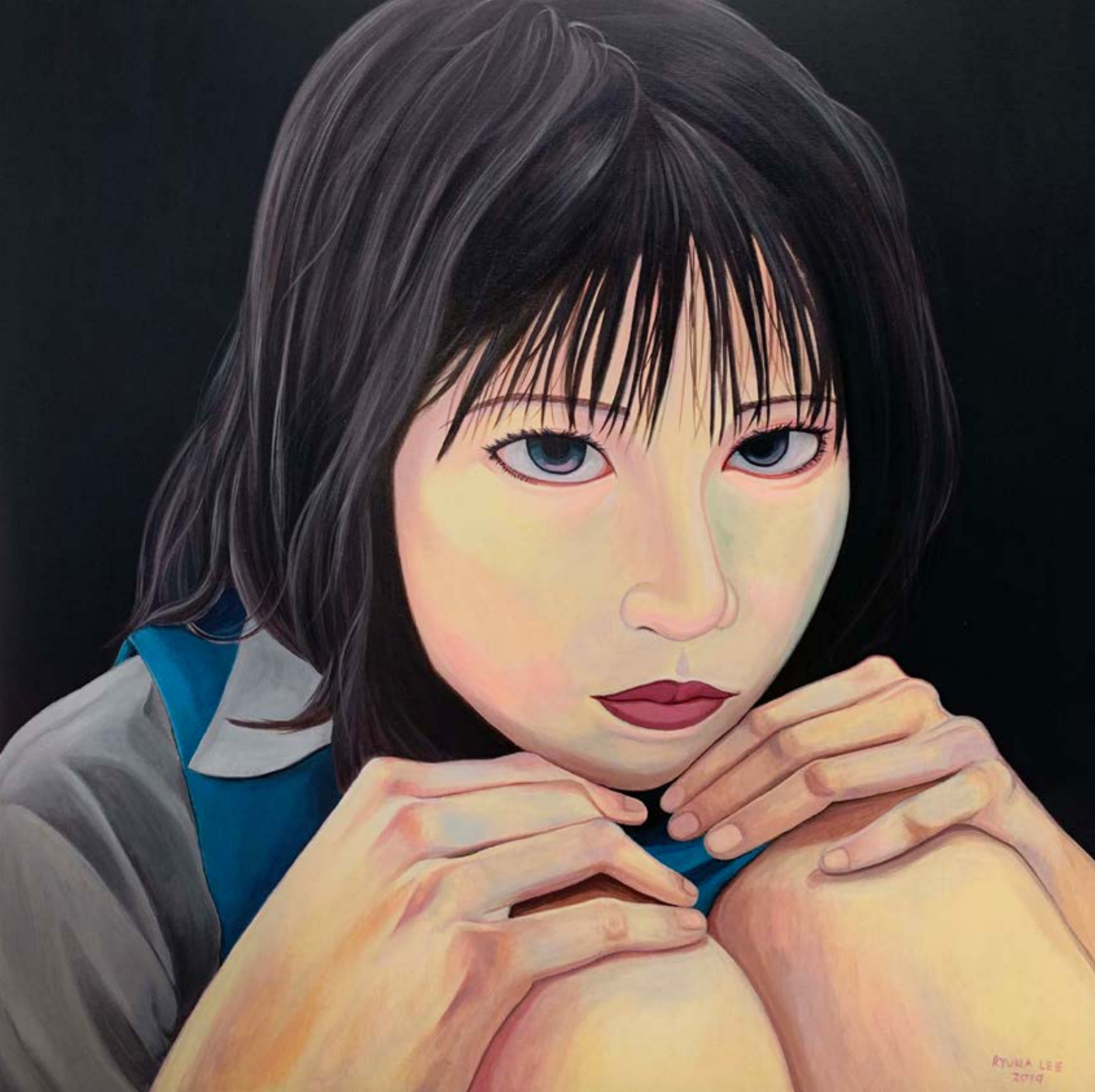
Ryuna Lee At Times A Tree Is Better Than A Forest 2019 140x140cm Acrylic on Canvas