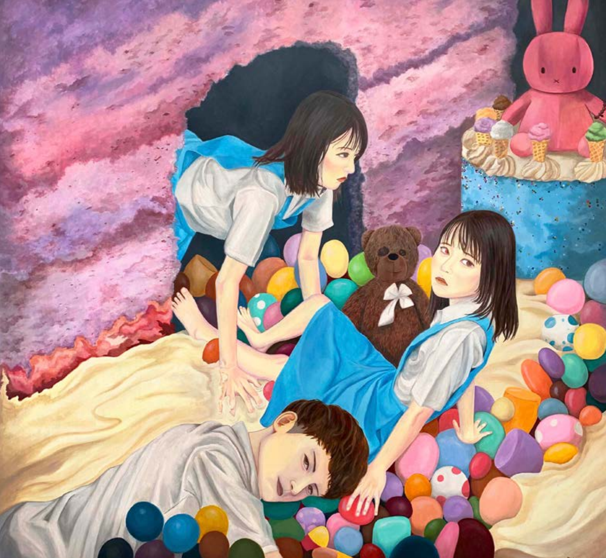
Ryuna Lee I Promise To Be Good 2019 160x153.31cm Oil and Acrylic on Canvas