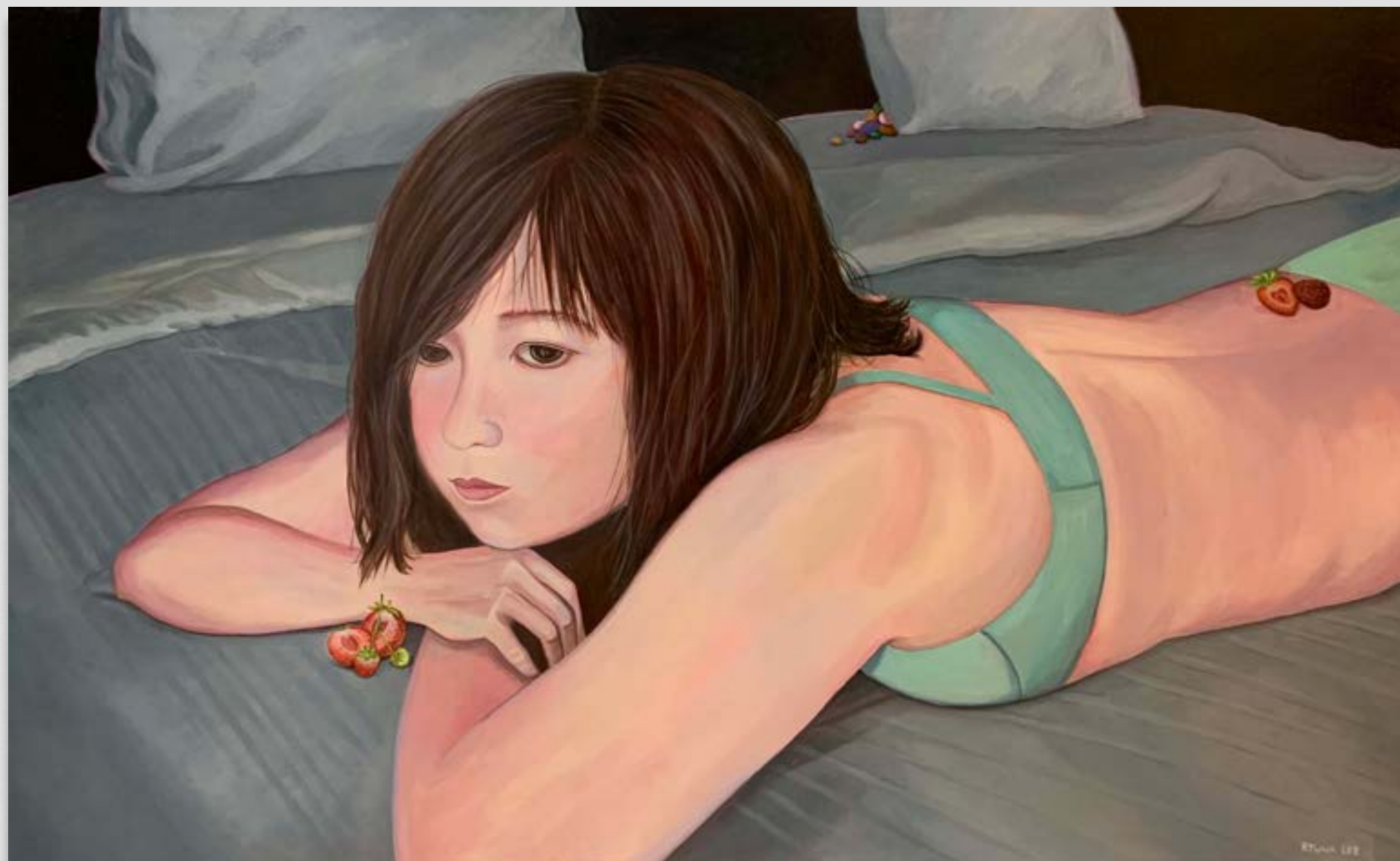
Ryuna Lee A Pie In The Sky 2019 94x153.5cm Oil and Acrylic on Canvas