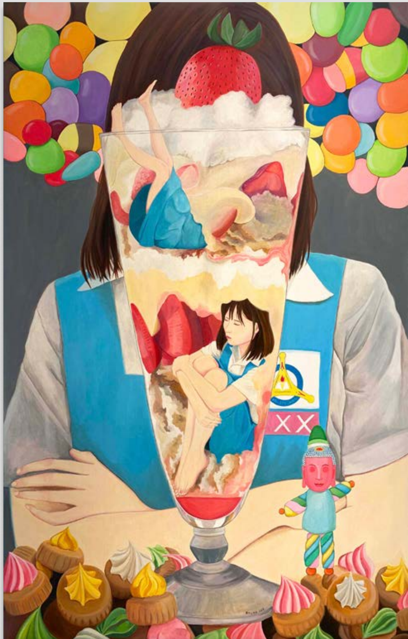
Ryuna Lee It's Not Perfect Without A Banana 2018 187x120cm Oil and Acrylic on Canvas