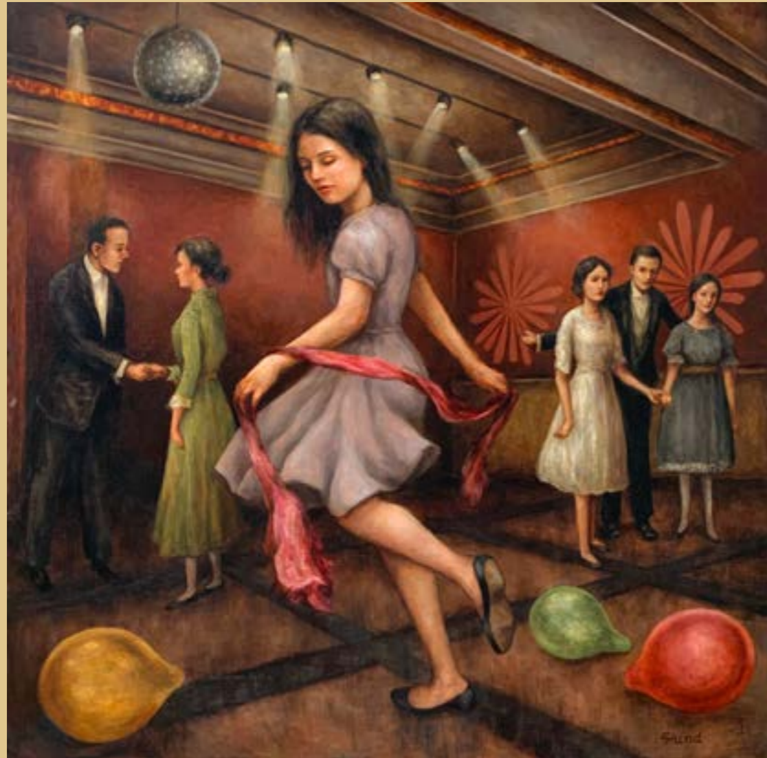
Red Sky At Night 2019 Oil on Canvas 91x91cm

Nevertheless , as the years pass by, such memories of what has conjured has a deep influence on him. Locked inside his little grey cells, he managed to capture specific moments of those glorious images and today, allowed them to be replayed as narratives on his canvasses. Elements of nostalgia are his adventure.