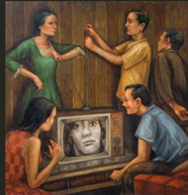
Signal Catcher 2019 Oil on Canvas 91x91cm