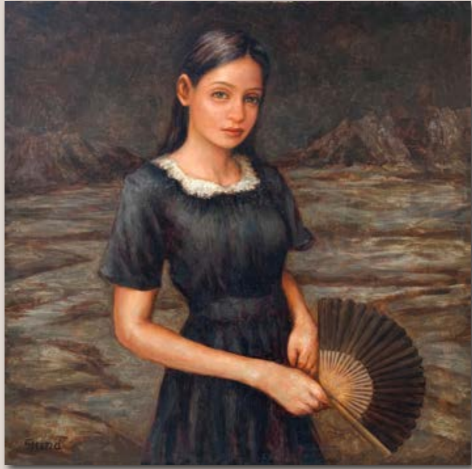
Nami 2019 Oil on Canvas 76x76cm