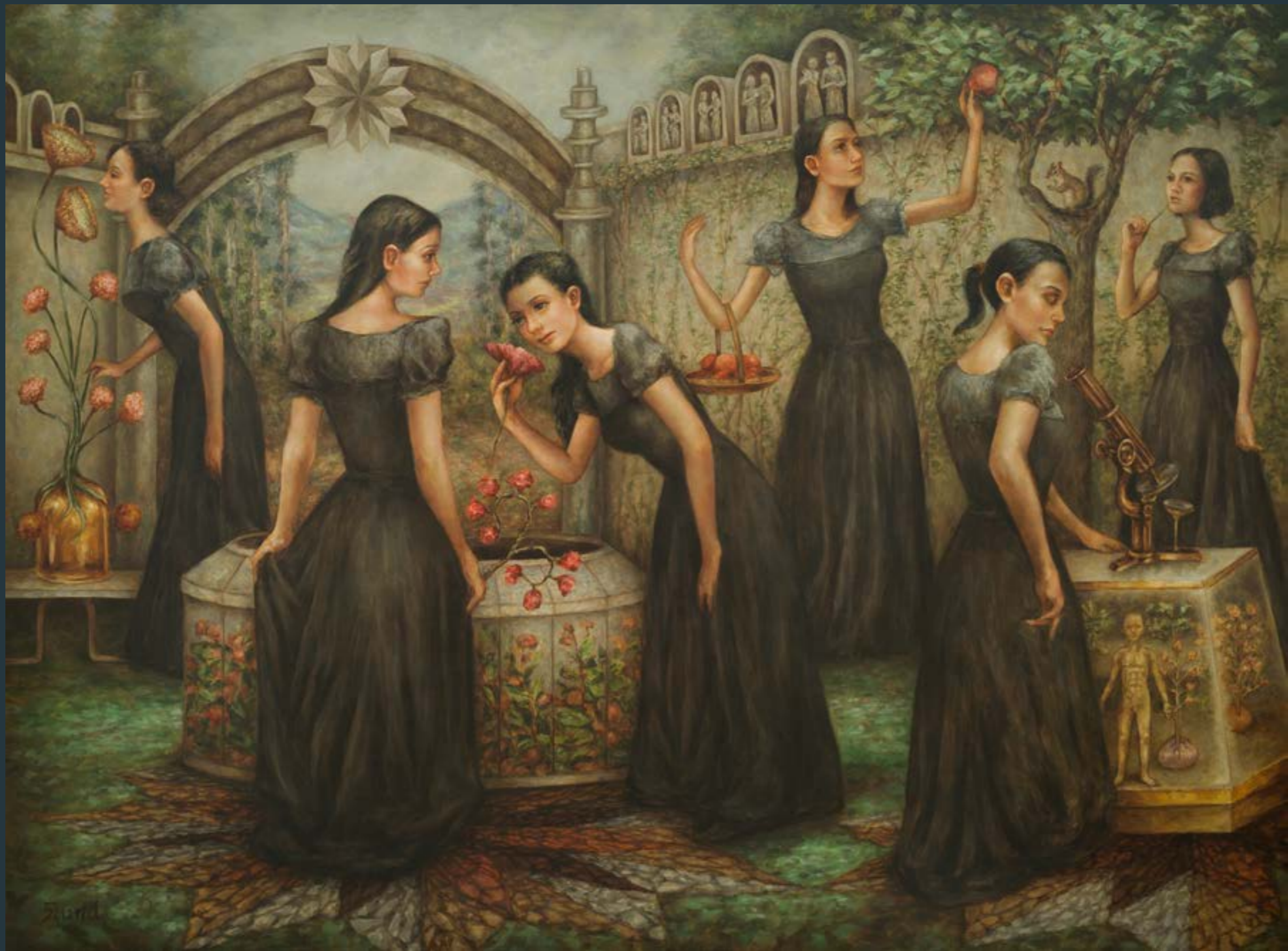
Voynich Garden 2019 Oil on Canvas 150x200cm