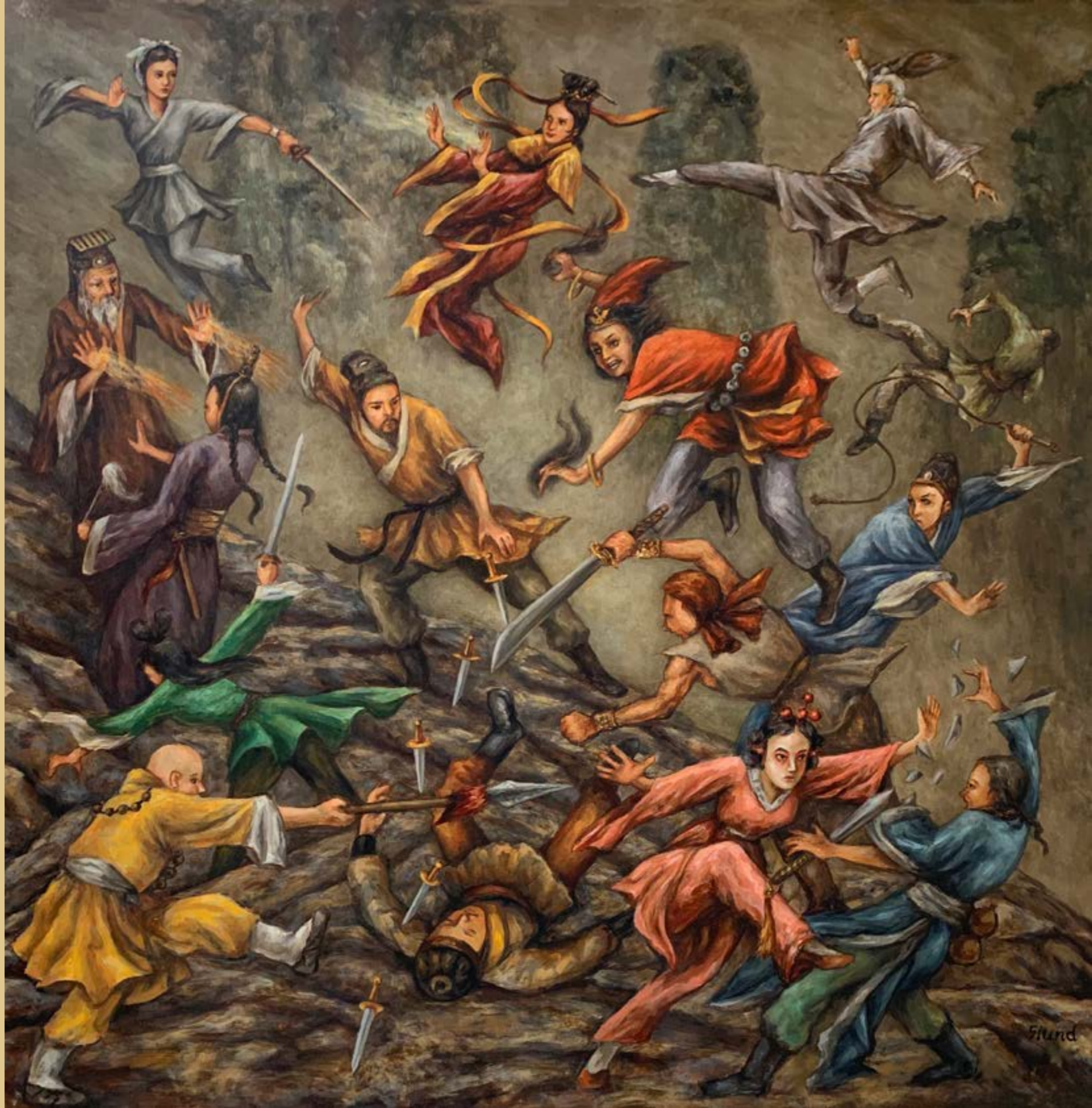
The Battle of Crane Mountain 2019 Oil on Canvas 132x132cm