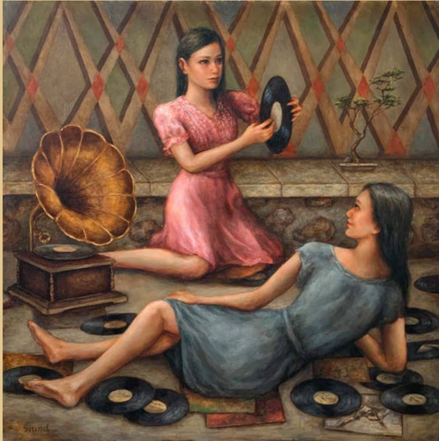
Black Mirror 2019 Oil on Canvas 91x91cm