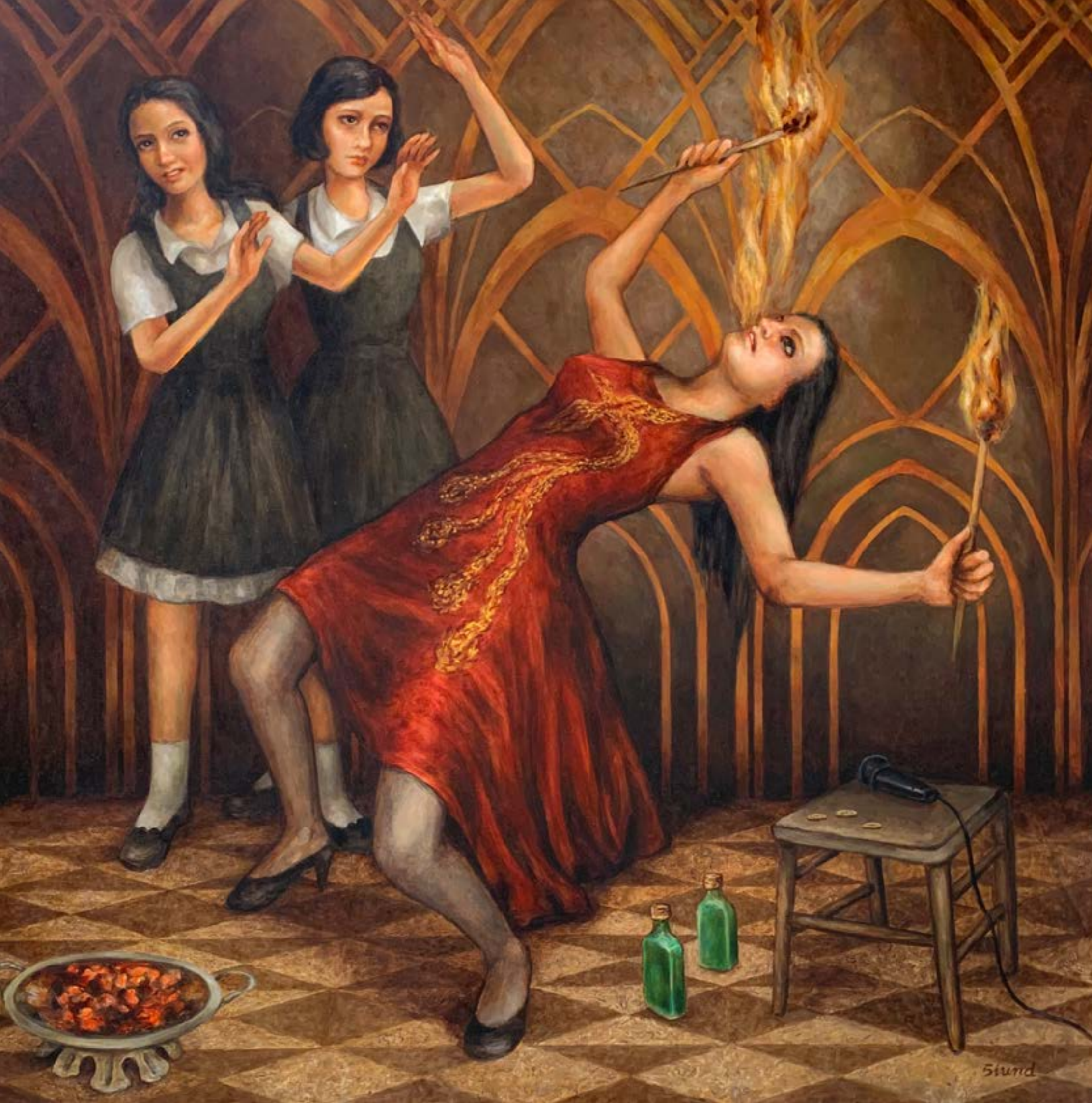
Phoenix 75 2019 Oil on Canvas 132x132cm